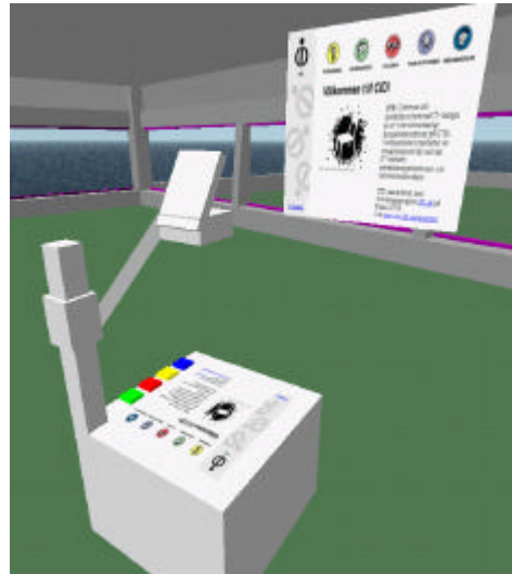
Figure 2. The slide projector.

The slide projector control buttons are made invisible when the user moves away from the projector. This is done mainly to remove on-screen clutter, but also to avoid situations where other users than the presenter click on the buttons by mistake. Initial tests suggests that it is important to give the presenter a sense of control over his or her presentation. By removing the ability to change the current slide away from the projector (without holding the remote control), an increased sense of presentation ownership is obtained.