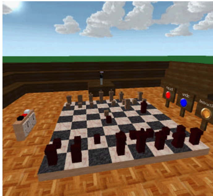
Figure 6. The chessworld.

The chessworld environment consists of a large chess board surrounded by a spectator arena, as shown in figure 6. Apart from the standard set of chess pieces, it also contains a fully functional chess clock and the ability to undo previous moves. Presently, it is not connected to a computerized chess server. The arena was built in such a way that both spectators and players get a good overview of the game. The chessworld also contains a portal for moving back to the meeting environment.