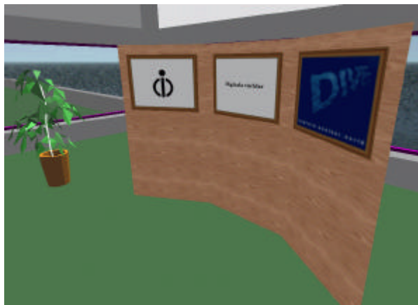
Figure 5. The display wall.

The display wall, shown in figure 5, is used to present WWW pages that are relevant to the current meeting. When clicking on one of the displays on the wall, the Netscape browser is pointed to the corresponding URL (if it is running on the user's workstation). In this way, meeting participants are given a facility for gathering around a relevant source of information and discuss it together. An alternative is to display the WWW page itself on the wall, which would allow users to directly point to interesting parts of the page and interact with it.