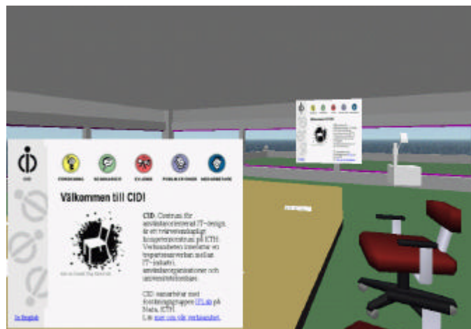
Figure 3. The user has picked up the presentation notes.

The hardware limitations in size and resolution of the physical display (i.e. the computer monitor) makes it unpractical for all meeting participants to view the slides on the display screen within the 3D environment – it either has to be very large or the participants have to remain close. A solution to this problem that is compatible with the design philosophy to keep as much information within the 3D environment itself, is to allow the users to pick up a set of "presentation notes" from the conference table. When this is done, the current slide appears in front of the user in the lower left corner of the view of the 3D world, as shown in figure 3. Other meeting participants can see the notes as a hovering paper, as shown in figure 4.