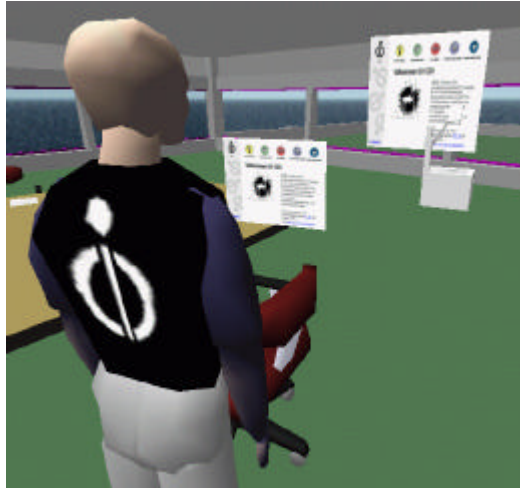
Figure 4. Presentation notes can be seen by other users.