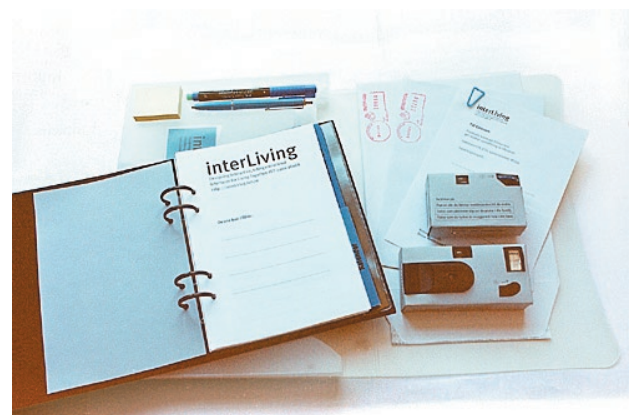
Figure 1. The kit of cultural probes given to the families.

Published in the proceedings of the research into practice conference publication 2004, University of Hertfordshire, Faculty of Art and Design. http://www.herts.ac.uk/artdes1/research/res2prac/