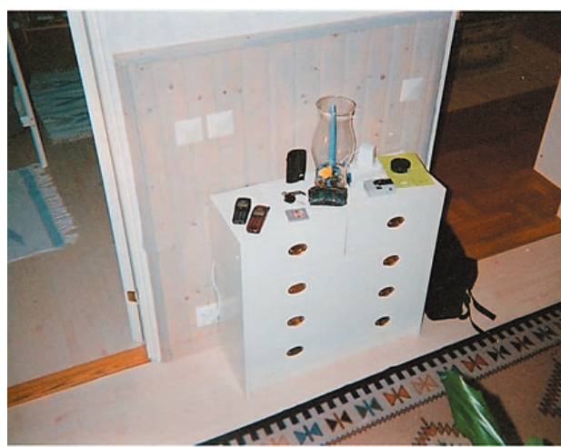
Figure 6. The top of this drawer worked as a shared information surface.]

The children liked the cameras very much because of the obvious way of how to handle it, the robustness and the instant delivery of the photos. The Polaroid became the entrance to the cooperative work with them.