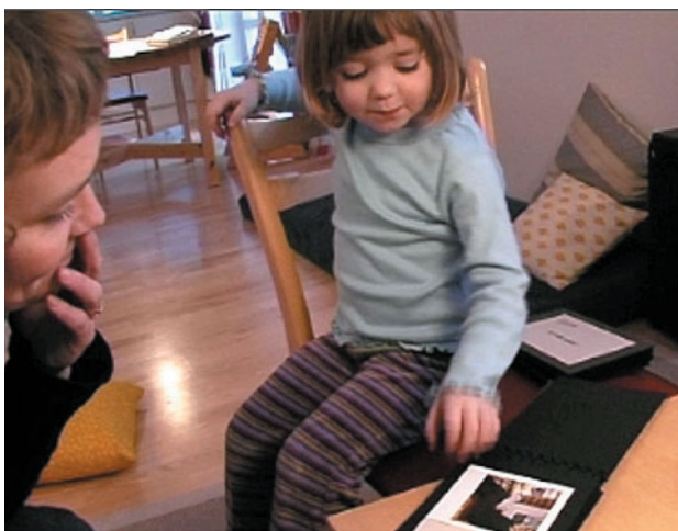
Figure 7. A video cut from an interview regarding a child's photos.

The first three items in the list are rather obvious and expected. Artefacts can of course facilitate someone to communicate issues to someone else. The photo and video artefacts worked as representations in ways that words hardly could have done. This is especially important since nearly half of the participants were