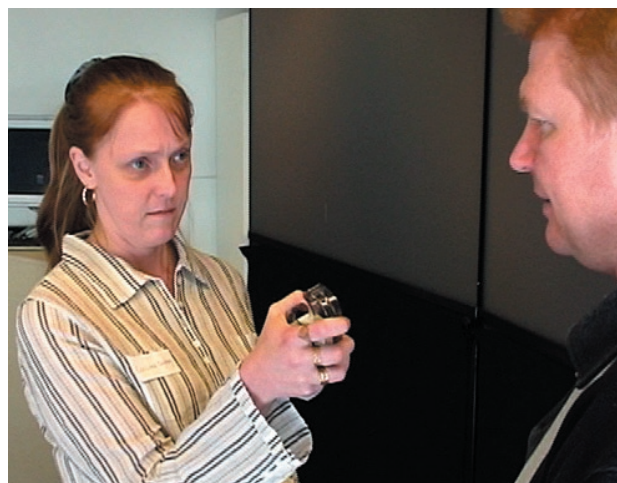
Figure 4 (above). The tape dispenser here represents a recording device.