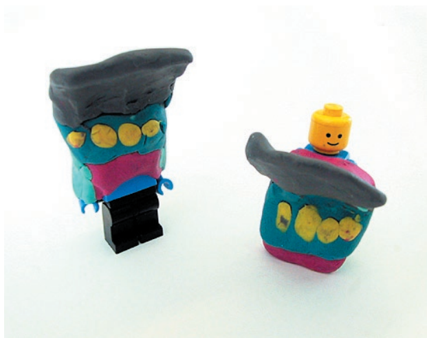
Figure 5. The BongoFax prototype.

While he was telling the whole group this, his father looked a bit uncomfortable and tried to interrupt the presentation. He thought the idea was a bit stupid. The father instead, presented the idea to put GPSs on all his sons, so that he could keep track of them.