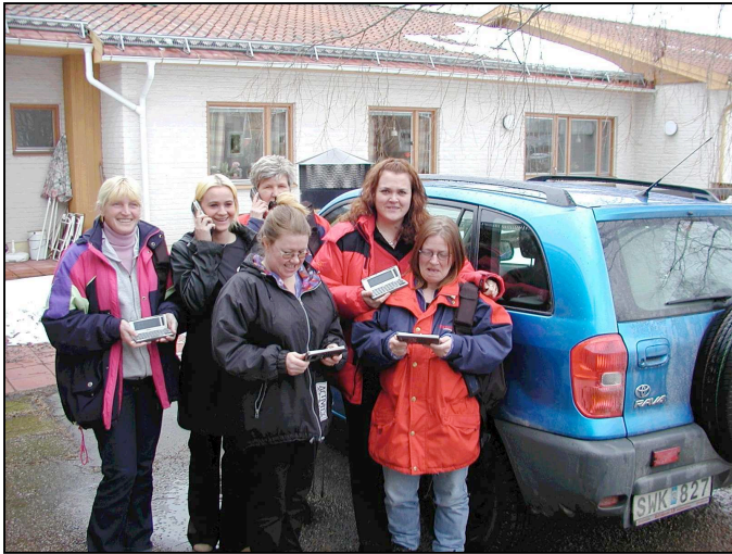
Figure 1. In the IT Prize Contest 2002, Stocka-Ström home healthcare for the elderly received an honorary mention. TimeCare, the winner that year was later to become the first software to receive the User Certified 2002 certificate.

Through iterative development of quality criteria – in eight pilot studies (see Table 1), in four yearly evaluations of a total of 20 nominees to the IT Prize finals, and in four project panel seminars – six groups of criteria emerged with a total of 36 criteria (criteria per group in parentheses): 1. Overall benefits (3), 2. Deployment method (9), 3. Technical features (10), 4. Work task support (6), 5. Communicative support (5), 6. Local assessment method (3).