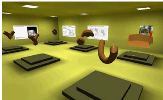
Figure 2. CyberMath, the generalized cylinders exhibit, where the distributed lecture was held.

The animations are controlled through an interface which enables starting and stopping as well as changing between displaying the animations in rendered or wire frame mode.