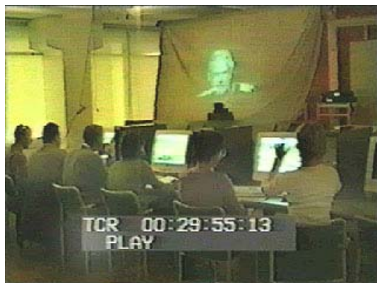
Figure 3. Students and the virtual teacher in Uppsala

The two physical spaces in Uppsala and Stockholm were connected by a telepresence system using two-way video on a simple H. 261 protocol with a 128 kbps dialled up ISDN line. The CyberMath system provided communication through the Internet.