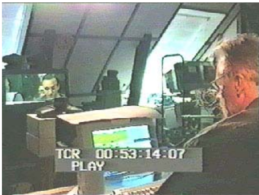
Figure 4. The studio of the teacher in Stockholm

experience the teacher as sitting in front of his own workstation, at the same level as the students, meeting their eyes when looking up. Because of this, the teacher in Stockholm was produced with a black background in order to achieve a video signal level just beneath the video black level, so that only the body of the teacher would appear on the screen in Uppsala. An advantage caused by isolating the body of the teacher was the reduction of distractions on the incoming video in Uppsala. Another advantage was that the H.261 MPEG compression could work with just the changes in the picture from the movement of the teacher. A remote-controlled camera was placed as low as possible in front of the back-projected screen in Uppsala, representing the eyes of the teacher. The camera was pre-programmed to 3 positions, each one framing a two-shot student group sitting in front of their workstation. It was important to position the camera as close as possible to the position of the projected eyes of the teacher in order to achieve an eye-to-eye contact. Moderate lighting was used in order to achieve better quality of the outgoing video signal from Uppsala.